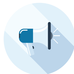
MARKETING & PROMOTION