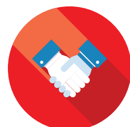
FOR THE HOMEOWNER