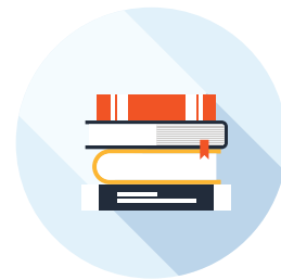
SHOW YOUR EXPERTISE